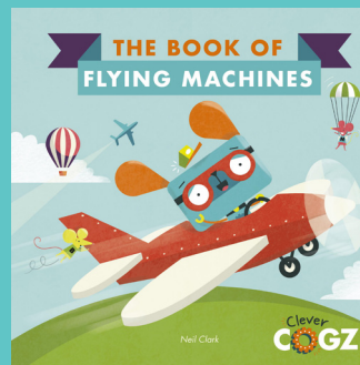
The Book of Flying Machines ISBN: 9780712243446