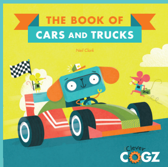
The Book of Cars and Trucks ISBN: 9781786036308