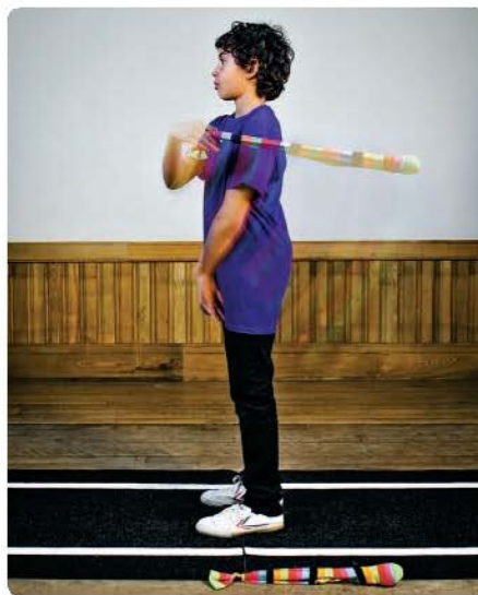
Fig. 3 One poi across body (forward).