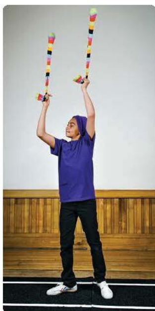
Fig. 7 Turning: Arc poi toward sky as you pivot back to where you started.