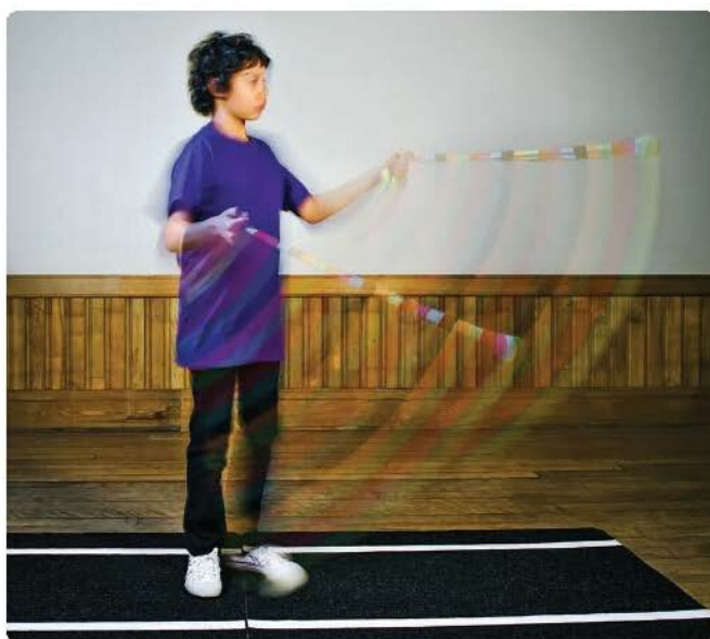
Fig. 6 Turning: Sweep poi toward floor as you pivot 180 degrees.