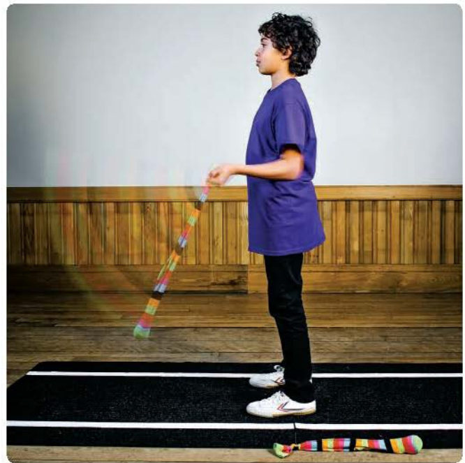
Fig. 2 One poi forward.