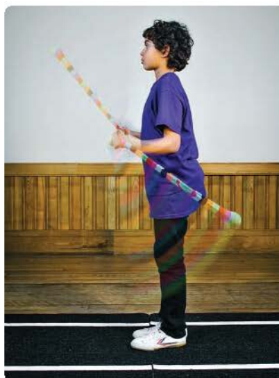
Fig. 4 Two poi, split-time.