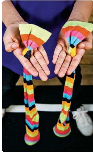
Fig. 1 Hold the poi like this.