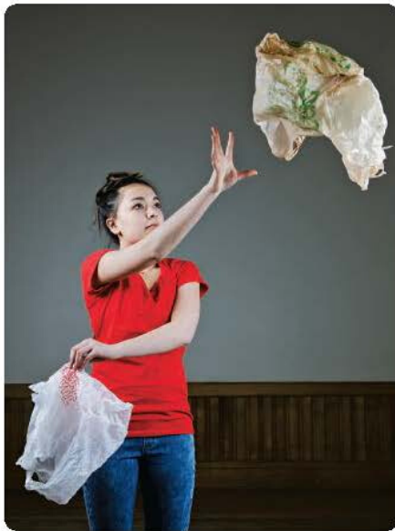
Fig. 4 Two ducks throw across...