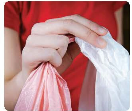
Fig. 6 Hold two bags with one duck.