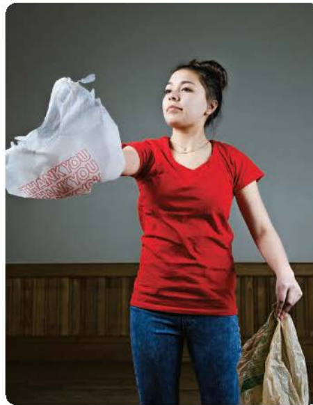
Fig. 5 ... and snatch down.